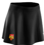
MCFNL Women's Umpire Black Skort $ 40.00 AUD

Umpires that fail to comply with ByLaw 77.2 (uniform) will incur the following penalties