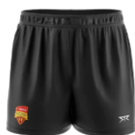
MCFNL Women's Umpire Black Short $ 31.00 AUD