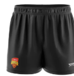
MCFNL Men's Umpire Black Short $ 31.00 AUD