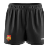
MCFNL Men's Umpire Black Short $ 31.00 AUD